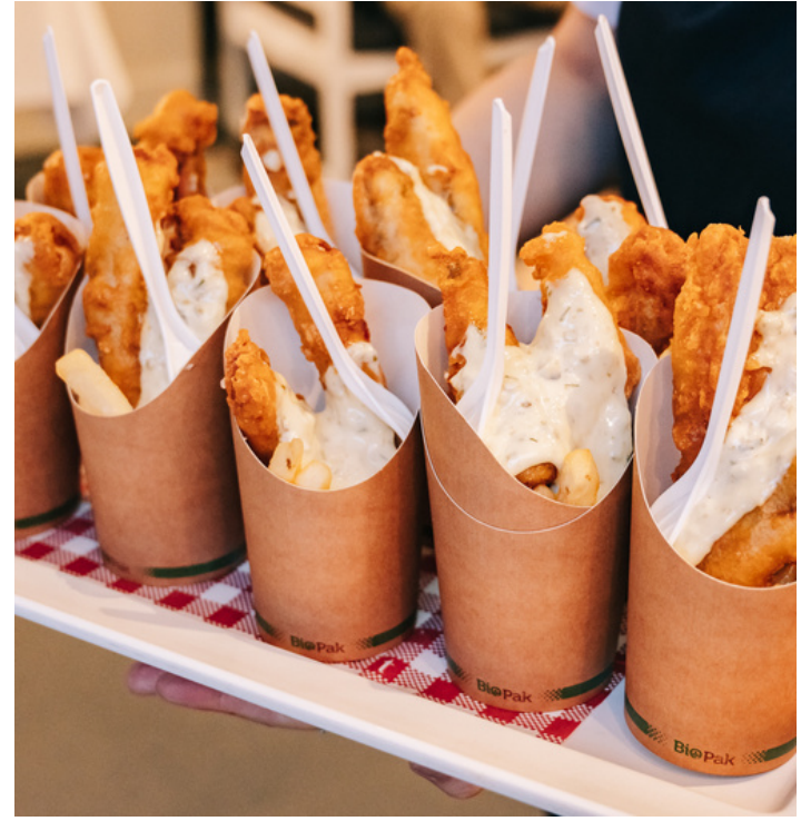
Events at Helm Bar & the Cockle Bay Yacht Club