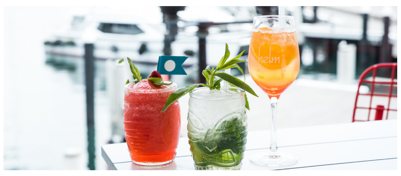
Events at Helm Bar & the Cockle Bay Yacht Club

Products may change without notice based on pricing and stock availability. In this case, a similar product will be used to replace it.