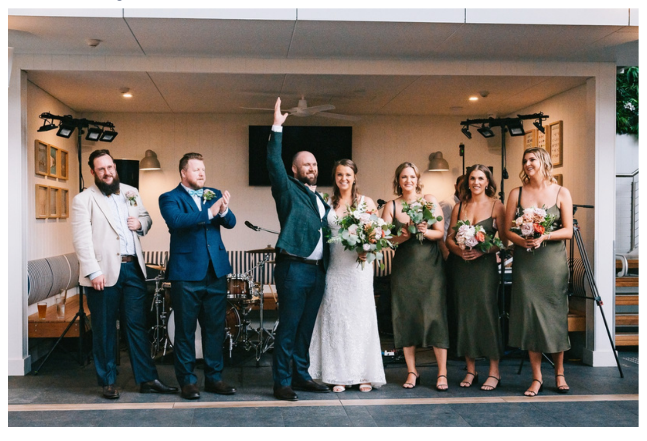
Events at Helm Bar & the Cockle Bay Yacht Club

Additional hours and timings outside of the above are available by request and will incur additional charges. Access times for stylists to bump in and out of the venue to be arranged with the Event Manager.